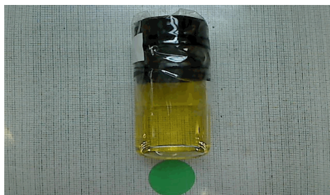
View of content (1mm x 1mm scale)