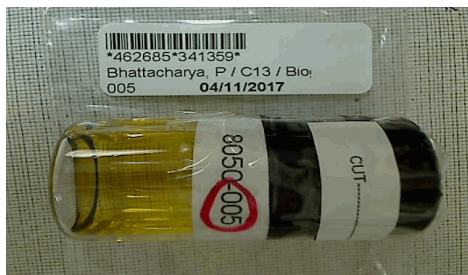
Package received - labeling COC